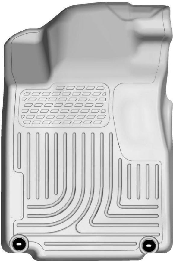
LEFT OR DRIVER'S SIDE