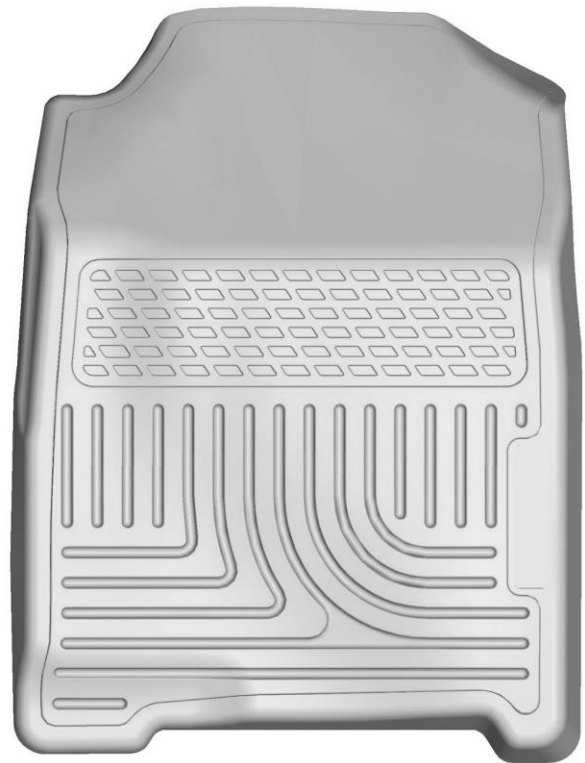
RIGHT OR PASSENEGER'S SIDE

TO EASE INSTALLATION OF YOUR CR-V FRONT FLOOR LINERS, FIRST SLIDE BOTH FRONT ROW SEATS BACK TO EXPOSE THE FRONT FLOOR PANS. INSTALL LINERS TAKING CARE TO ATTACH THE DRIVER'S SIDE LINER TO THE FACTORY TWIST-LOCK RETAINERS. ONCE YOU HAVE INSTALLED THE FRONT LINERS, REPOSITION THE FRONT SEATS AS DESIRED.